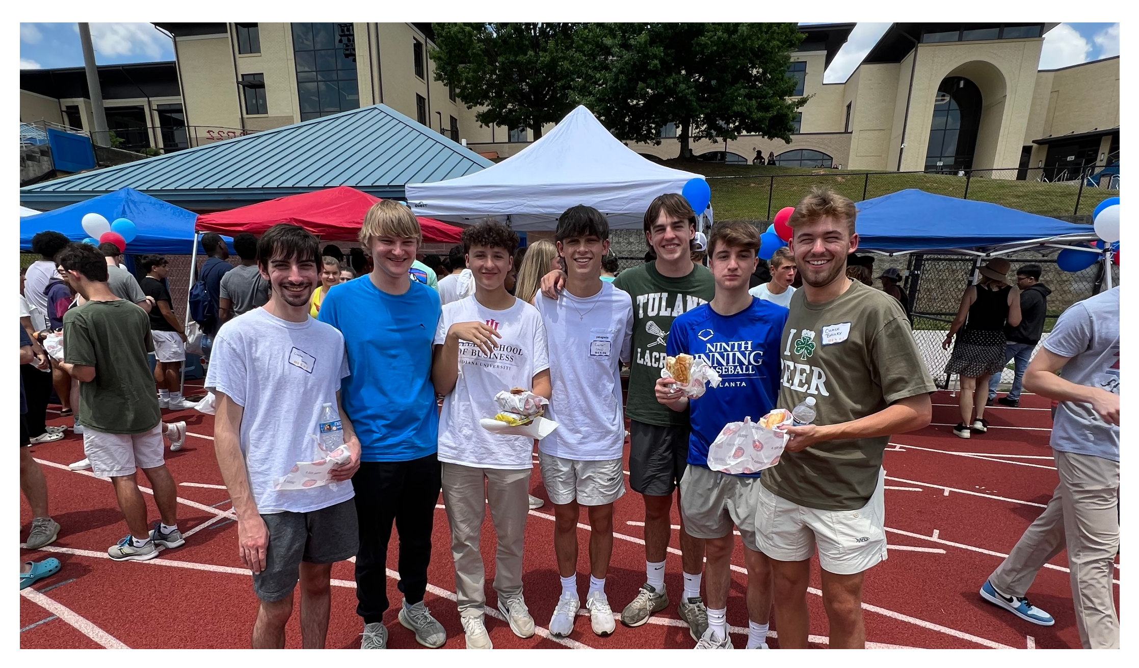
The Class of 2022 enjoying their Senior Celebration